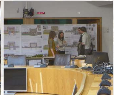
Illusion of Memory exhibition, Scottish Parliament May 2015